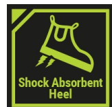
Shock Absorbent Heel