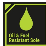
Oil & Fuel Resistant Sole