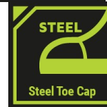
STEEL Steel Toe Cap